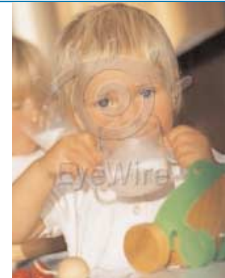
caption area caption area caption area

As the older infant grows into a toddler, parents will notice their child's increased interest in sitting at the table with the rest of the family, usually around 18 months of age. Since this is also an age when children become very interested in imitating others, it is important to have meals at a family table where the child can closely watch the family eating (Rozin, 1996). While keeping toddlers in high chairs may keep them contained (somewhat), it also perpetuates physical separation from the family and doesn't allow them to see well enough to learn by imitation. Ideally, the family will use a height-adjustable high-chair which can be pushed up to the family table with the tray