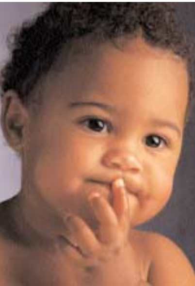
caption area caption area caption area

With regard to kinesthesia, drinking from a nipple does not require much body awareness since the nipple fills up much of the mouth. A puree coats the inside of the mouth and is not difficult to locate from a body awareness standpoint either. However, a small piece of table food can be easily lost in the mouth if there is not good body awareness. Older infant and toddlers need to be able to track each piece of food in their mouth so they do not accidentally bite their tongue or cheek instead of the food. In addition, the food must be followed inside the mouth to know that it has been placed correctly onto the molars, and where it is located when it is time to swallow. You have experienced a kinesthetic awareness problem if you have ever eaten popcorn and ended up with a popcorn shell stuck in the back of your