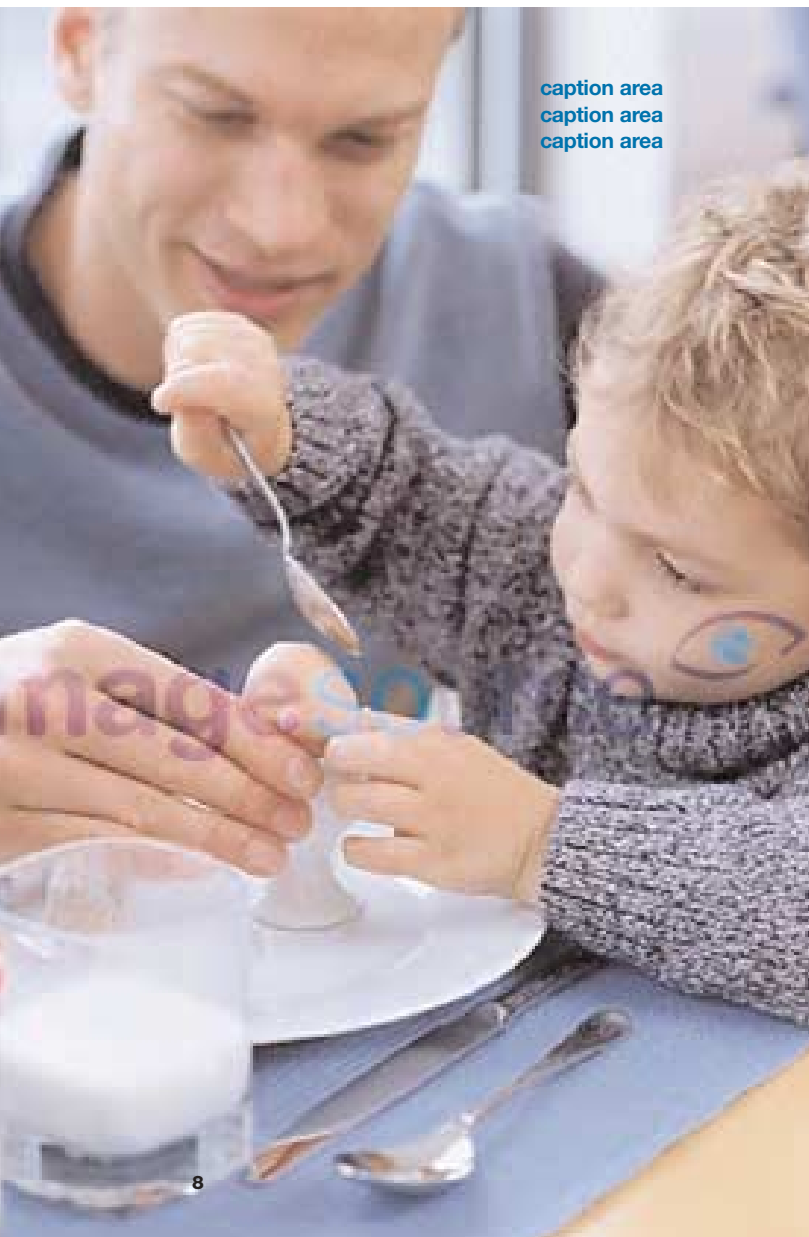
caption area caption area caption area

Weingarten HP: Learning, homeostasis, and the control of feeding behavior. In: Taste, Experience and Feeding, E Capaldi and T Powley (eds), pgs 45-61. American Psychological Association, Washington DC, 1990.